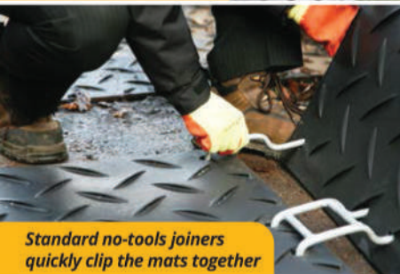
Standard no-tools joiners quickly clip the mats together