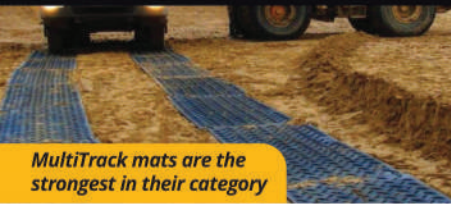
MultiTrack mats are the strongest in their category