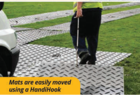
Mats are easily moved using a HandiHook