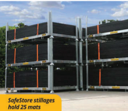
SafeStore stillages hold 25 mats

Overall Size: 2435 x 1215 x 13mm (plus treads)